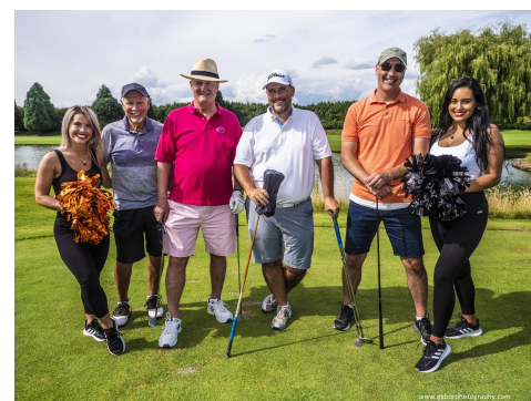
Photo with the Felions

Network with prospective customers, or engage face-to-face with key decision makers!