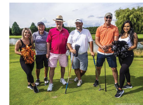
Photo with the Felions

Network with prospective customers, or engage face-to-face with key decision makers!